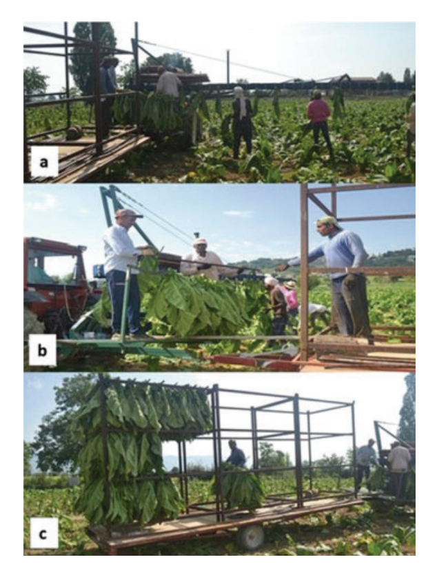
Fig. 5 Tobacco leaves harvestings

Finally, throughout the tobacco leaves collection operations carried out, the articulated chain inside the facilitating arm worked continuously without jamming problems. The ring chain sections inserted along the articulated roller chain did not create any mismatches in the coupling with the teeth of the wheels and the transmission of motion between the toothed wheels took place with evenness.