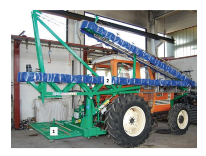
Fig. 1 Kentucky Black tobacco leaves facilitating arm manufactured by Pulcinelli Giovan Battista Ltd.: 1. support frame linked to the rear 3-point hitch of the tractor; 2. folded truss beam arranged parallel to the tractor forward direction

to a second steel truss beam, through another cylindrical joint can rotate with respect to the first one in a vertical plane by way of a hydraulically operated mechanism. Therefore, it can be positioned horizontally aligned with the other beam for the harvesting operations or be positioned overturned so to reduce the overall size of the arm (Fig. 1). The mutual rotation of the two truss beams in the vertical plane is an effective solution because it allows to considerably reduce the sizes of the agricultural implement for the transport phases [13].