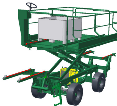
Fig. 1. WPO Pulcinelli PSRF 2.4

Considering the guidelines of the EN 16952, an example of calculation has been carried to verify the state of minimum stability during the effective operative condition of the work platforms used for fruit harvesting selected among those available on the market: the “Pulcinelli” model PSRF (Figure 1).