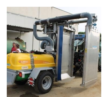
Figure 1. Trained air blast single-row tunnel sprayer built by Maggio Company

The trained air-blast tunnel sprayer (Figure 1), manufactured by the Company Maggio with the collaboration of the DiSAAT, is specifically designed for pesticide application in espalier vineyards of the Salento. The machine is built by adopting a galvanized steel frame on which the following elements are arranged: the 1000 L tank for the mixture; the axial fan; the pump unit with its connections; valves to control and limit pressure and to control flow volume; positional hydraulic and mechanical servo-mechanisms for the motion of the shields; the piping for conveying the air flow produced by the fan to the two shields of the tunnel. One of the shield of the tunnel is rigidly connected to the frame, while the other one can slide horizontally, allowing adjustment of the distance between the shields. The machine is equipped with sensors connected to the control unit, so allowing to evaluate in real time the operating parameters: nozzle flow rate, operating pressure, sprayer velocity, volume rate.